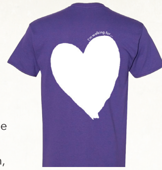
Back View of Customizable T-Shirt

When you raise $35 or more by April 11th, you'll earn a keepsake Luminary Walk t-shirt that can be personalized at the event. After April 11th, sizes and quantities will be limited.