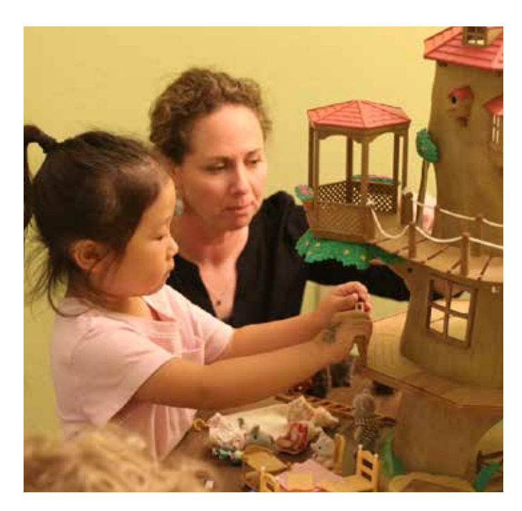
Partnering with school districts to offer compassionate and expert grief support has comforted students and empowered staff.

When asked to share the most helpful aspect of group support students said: "Learning how everyone is different" (grade 5), "Just being allotted time to talk about my person. It feels safe here" (grade 12), "Talking about my feelings and thoughts" (grade 4), "Being together" (grade 2).